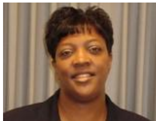
Mrs. Lillian Curry Jackson Public School District