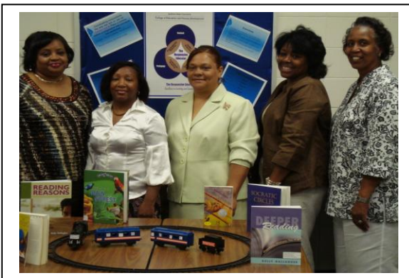
Language Arts Teachers