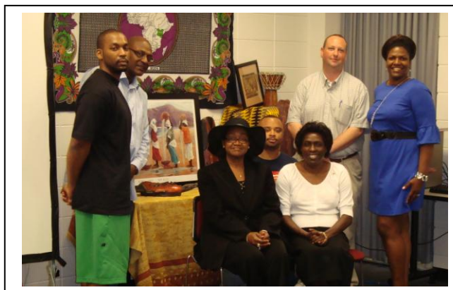
Social Studies Teachers