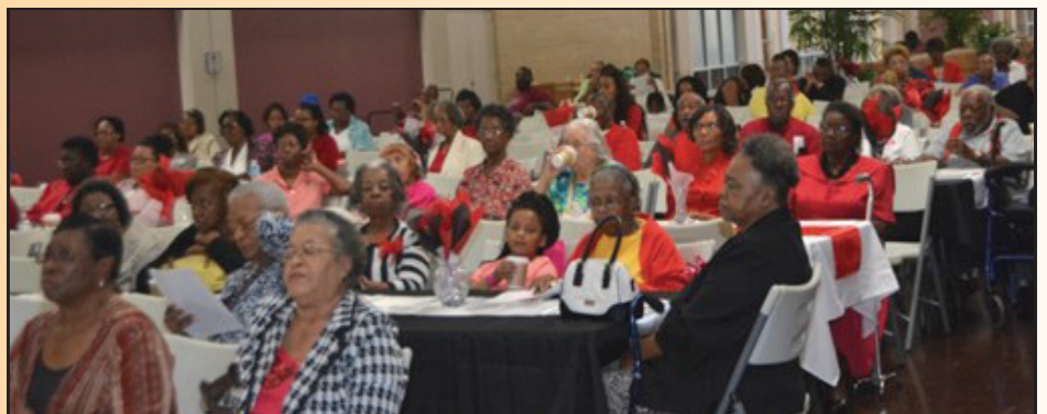
Audience members listen intently to presentations on cardiovascular disease and type 2 diabetes during the 15th Jackson Heart Study birthday celebration.

Thank you Jackson Heart Study family for another fabulous event!!