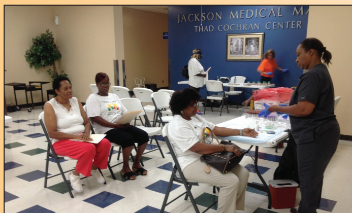
Participants in the Step N 2 Life health promotion research study get checked for blood pressure, weight, glucose and cholesterol.

In addition, final measures were completed on blood pressure, weight, glucose, and cholesterol. In the ceremony that followed data collection, participants gave testimonies about the value, impact, and the benefits that participating in this research had on their lives. Participants praised the Step N 2 Life coordinators for their foresight to take the steps to engage them in this life-saving endeavor. The research team is conducting data analysis with assistance from Jackson Heart Study Community Outreach Center investigators, and will make the study results available soon. So stay tuned!