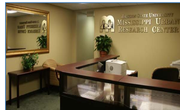
Mississippi Urban Research Center Office Suite

The Research Division's current research foci include: childhood obesity, health disparities, HIV/AIDS, and crime and violence. Many of the research initiatives focusing on these topics involve the RAND Gulf States Policy Institute. Additionally, the division houses the U. S. Census Information Center (CIC) and serves as an urban issues repository and clearinghouse. Research publications include the Online Journal of Rural and Urban Research (to be launched in April 2008) and The Urban Researcher .