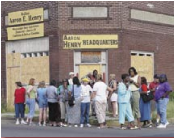
The week 1 field trip through the Delta included a stop in Clarksdale and a visit to Aaron Henry's former headquarters

raised a toast and shook their moneymakers in honor of that now-closed landmark of the blues, the Subway on Pearl Street in Jackson.