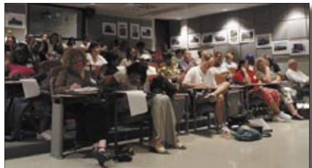
Lectures and oral history panels helped familiarize workshop participants with the significance of the various landmarks