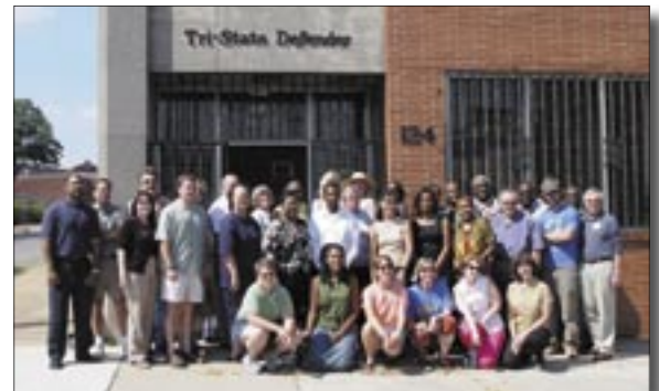
Week 2 workshop participants in front of the Tri-State Defender newspaper office in Memphis

http://www.npr.org/features/feature.php?wfid=3821251