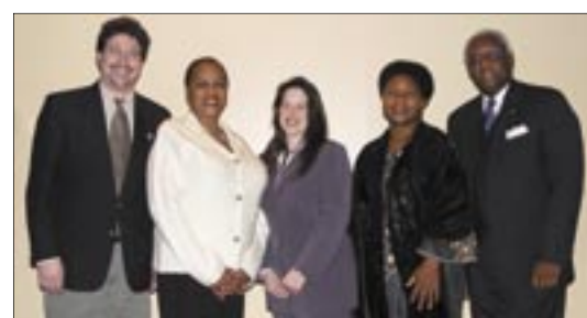
The Hamer Institute core faculty announce 2004 lecture series and tentative programming for summer 2005

The workshops will follow the basic outline of the 2004 Landmark program for high school teachers, but will be tailored to community college faculty and enhanced through improvements based upon this year's participant feedback. Institute faculty have clarified the connections between the Mississippi Summer Project and the Memphis Sanitation Workers'