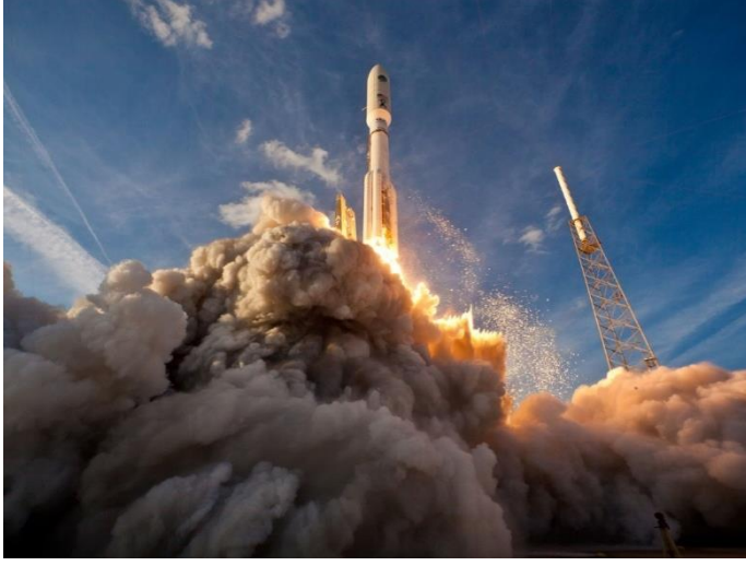
Atlas V launch of MUOS-1 Satellite.

Give our Detachment a call at 601.979.1620 or e-mail us at afrotc@jsums.edu if you have any questions concerning admissions.