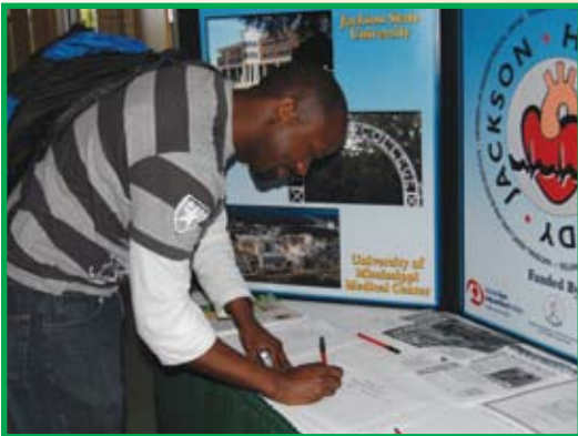
June 2009 Community Monitoring Board participant.

The Jackson Heart Study's 9 th Annual Celebration of Life once again proved to be a fun-filled, informative family affair! The Celebration, open to the community, was held at the Jackson Medical Mall, UMMC Conference Center on Saturday February 28, 2009. The purpose of the Celebration of Life!, one of the largest JHS community events, is to celebrate the legacies of our African American ancestors and families. This year's theme, "We are excited about Exam 3!", focused on the clinical components of the