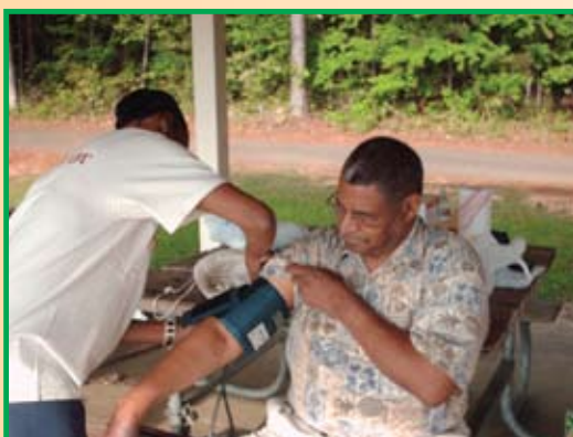
Rankin Community Health Walk participants

“There’s time enough, but none to spare.” — Charles W. Chesnutt. This quote is so enlightening when we think about heart disease, many people think that we have all the time in the world, but in reality we shouldn’t waste any of that precious time. This is one of many quotes found in the “With Every Heartbeat is Life” Training that is currently being used with all five Community Health Advisor groups. The Jackson CHAN specifically is indeed having a wonderful time every month covering the different sessions. Some of the sessions focus on cholesterol, blood pressure, healthy weight, and physical activity. Several members have even had the opportunity to share their personal experiences with heart disease. They have truly been educational but fun at the same time. These trainings are designed to empower the Community Health Advisors to go out in their respective communities and share the valuable information with their neighbors and friends, all in an effort to reduce the amount of cardiovascular disease among African Americans in the state of Mississippi.