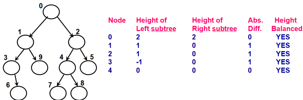
(b) A Binary Tree that is Height-Balanced

You are given the code for the binary tree implementation discussed in class. You could first find the height of each node in the tree and then test for each internal node: whether the difference in the height of its left child and right child is at most 1. If this property is true for every internal node, then we exit the program by printing the binary tree is indeed height-balanced.