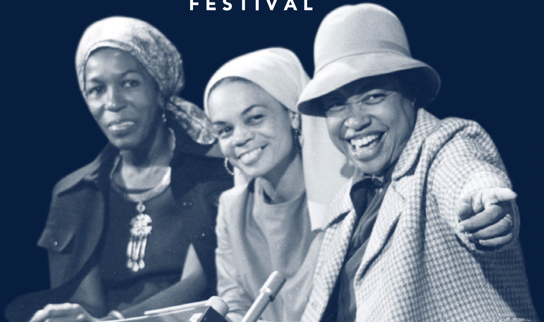
1973

Presented by the Margaret Walker Center & Jackson State University