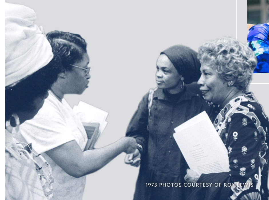
1973