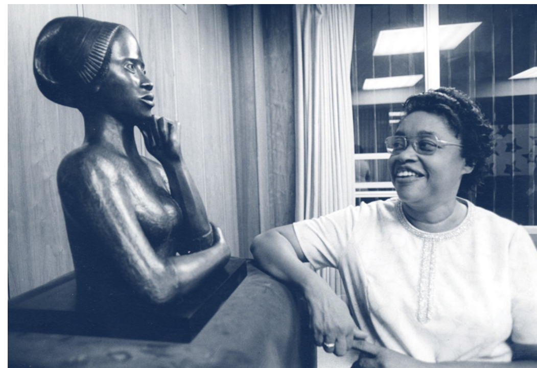
MARGARET WALKER WITH ELIZABETH CATLETT'S BUST OF PHILLIS WHEATLEY, 1973

In 1773, PHILLIS WHEATLEY published Poems on Various Subjects, Religious and Moral , the first authored book of poetry by an African American woman. Before enslavers kidnapped and sold a young Wheatley in Boston, she spent her early life in West Africa. An avid learner, she began composing poetry as an enslaved girl, later publishing and reciting her work before a global audience. Wheatley became a renowned poet who inspired many Black women writers, including Margaret Walker.