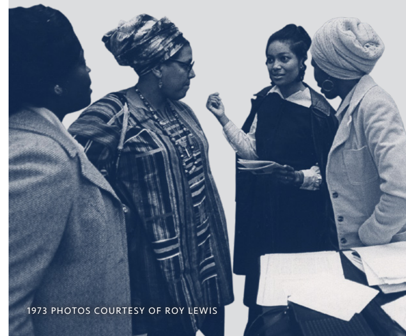
1973