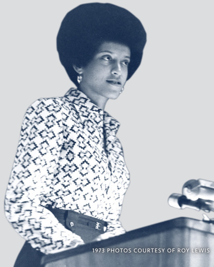
1973